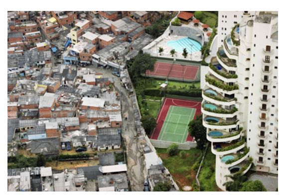
Stark divide between rich and poor in Sao Paulo.

The six articles and statement represent an attempt to come to terms with the dangers of basic income, as the Ontario Liberals moved towards initiating their pilot project. The first, "Looking the Basic Income Gift Horst in the Mouth," written when we had only the most general declaration of intent to go on with regard to the pilot, began to lay out a basic