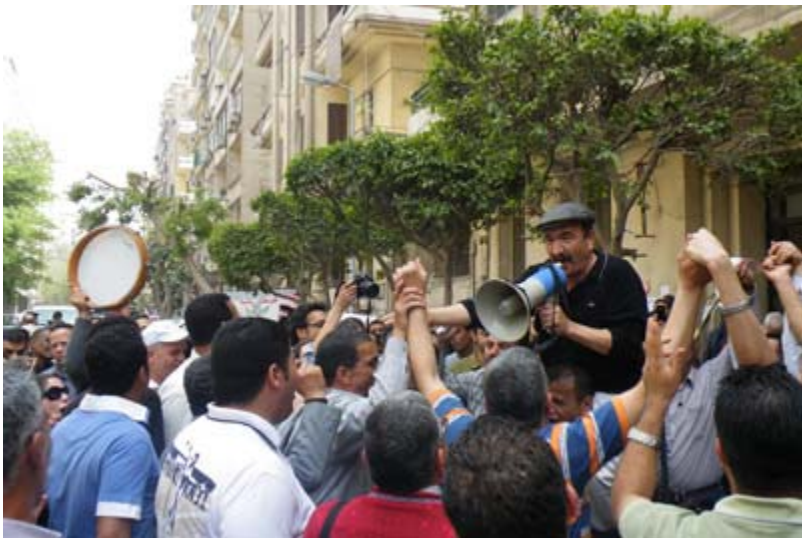
Workers from the Mahalla Textile Company voice their numerous grievances.