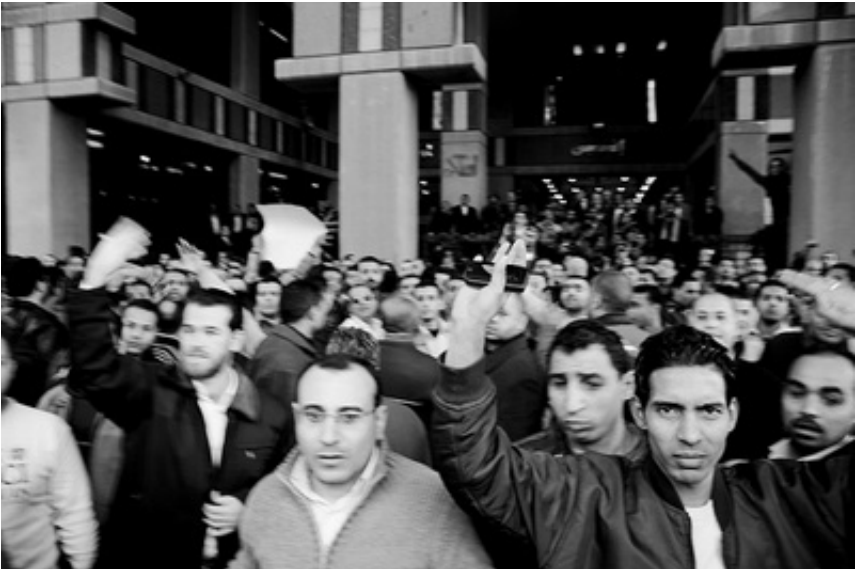
Thousands of workers from several oil and gas companies are on strike, protesting in front of the Ministry of Petroleum, in Nasr City.

According to official government statistics poverty increased from 20 per cent to 23.4 per cent from 2008 to 2009. This in itself is a significant increase but official statistics need to be approached with a large degree of skepticism. The official poverty line is set at an absurdly low rate – in fact, some 40 per cent of Egyptians live on less than $2 per day. The official unemployment rate is recorded at around 9 per cent, but again the reality is completely different – more than half of those outside of agriculture are found in the “informal sector” and are not properly recorded in the unemployment statistics. These informal workers live in a society that lacks any decent social provisions for education, health or broader welfare. It is estimated, for example, that one-third of the Egyptian