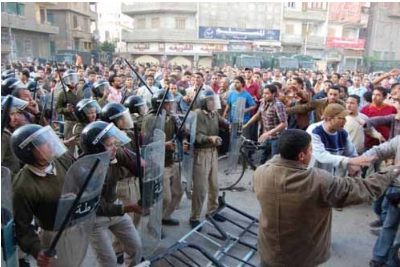
Protests in Mahalla - April 2008.

Earlier in 2006, Mahalla workers went on strike when Prime Minister Nazif reneged on his promise to increase sufficiently annual bonuses, which supple-